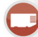
Memory & Data