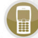
Housings & Fascias