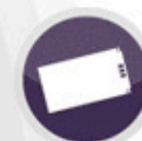
Batteries & Chargers